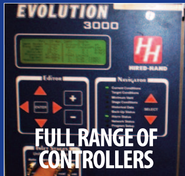
FULL RANGE OF CONTROLLERS